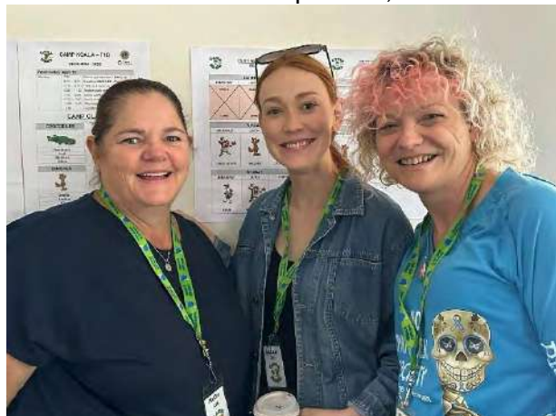
Nurse educators at Camp Koala

As mentioned in the last Newsletter, The latest grant of $3,000 was to Type 1 Foundation (Geelong) to support a diabetes camp for adults to be held at Camp Koala, Victoria.