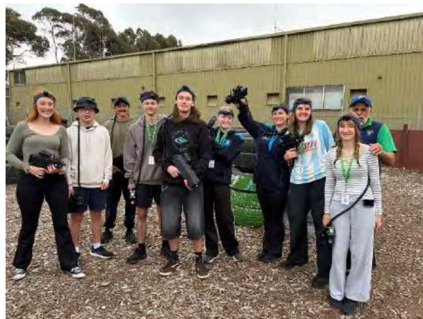
Young adult participants at Camp Koala

Clubs are reminded that The Lions Australia Diabetes Foundation welcomes Grant Applications from any Lions Club in Australia or its territories, for assistance with their diabetes-related projects. A Grant Application form is available for downloading from the LADF website. Details about how to fill in the form are included in the instructions attached to the form.