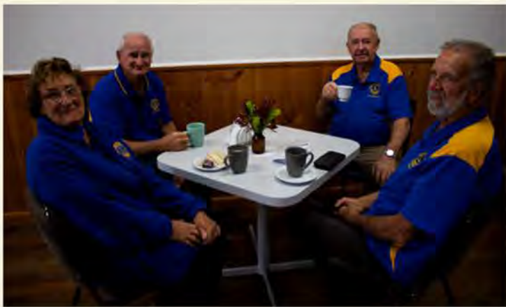
Tocumwal Lions - We had DOUBLE the number of stalls at our Mother's Day Made, Baked & Grown Market compared to our February market, which featured baked goods, honey, crochet, plants, artwork, preserves, cheesecakes, flowers, and more! There was a nice stream of people coming through the door all morning, and just as many were walking out with bags of goodies.