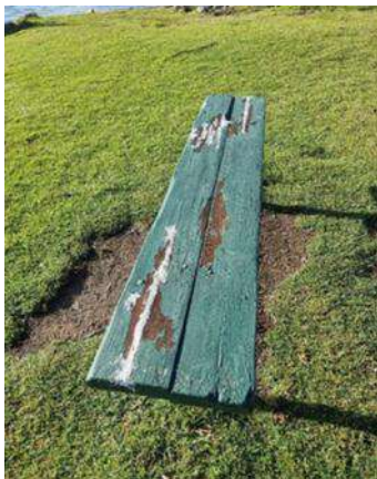
Aitchisons Point - Before