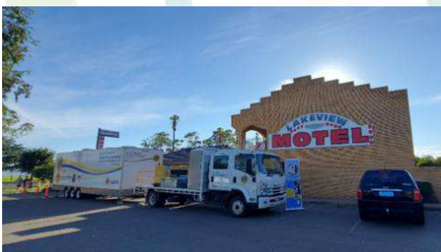
Van in place in IGA carpark and next to the accommodation.