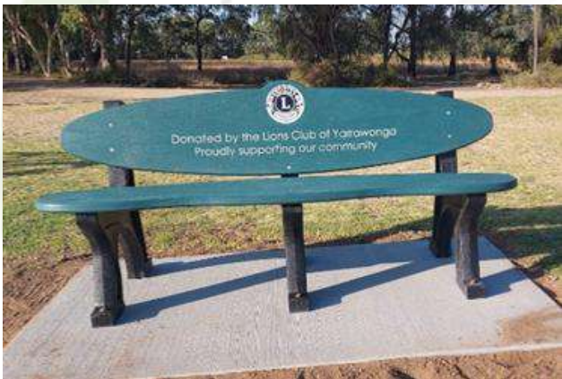
Aitchisons Point - Now