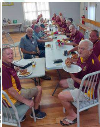
Members enjoying dinner