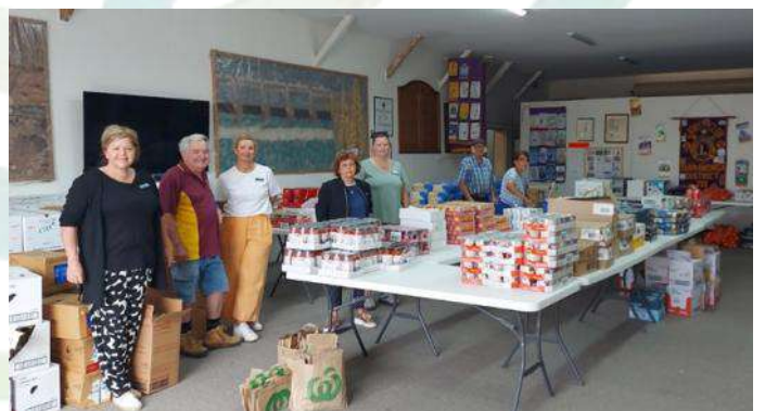
Pay it Forward event