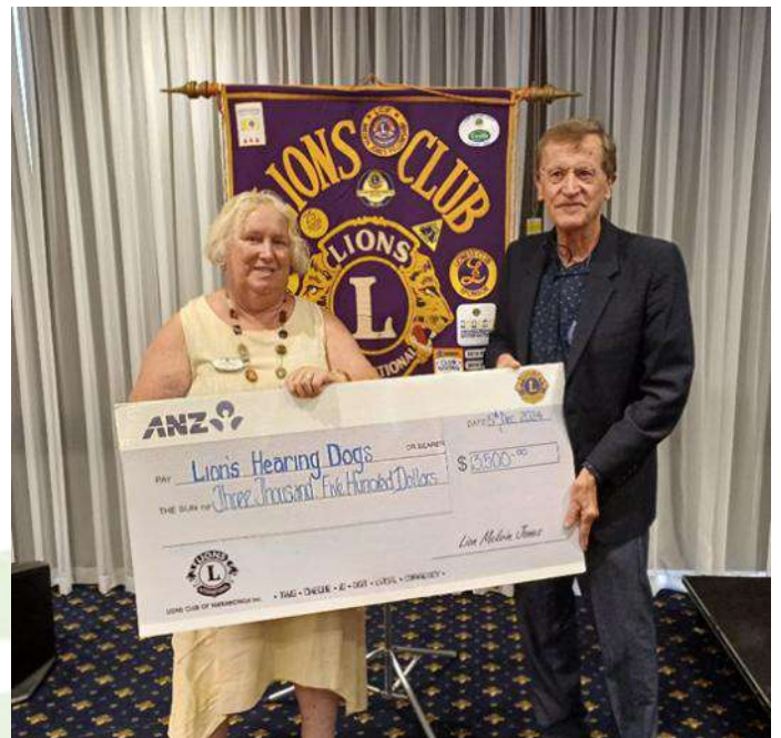
Cheque presentation with funds raised from the Dachie Cup