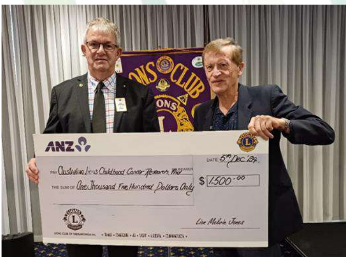
Cheque presentation with funds raised from the Town Garage Sale