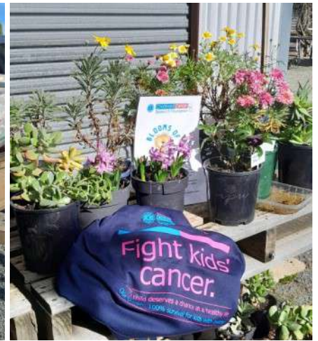
Hope Lions Blooms of Hope Project