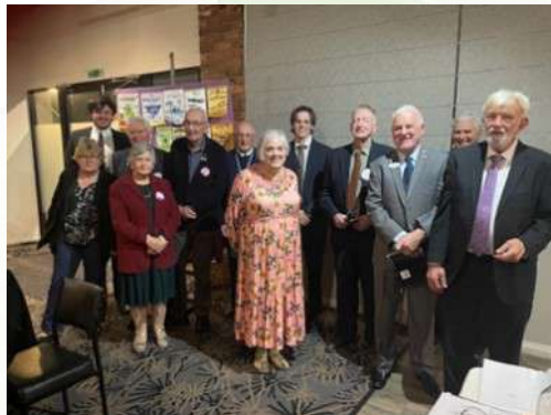
2024-2025 Numurkah Lions Officers