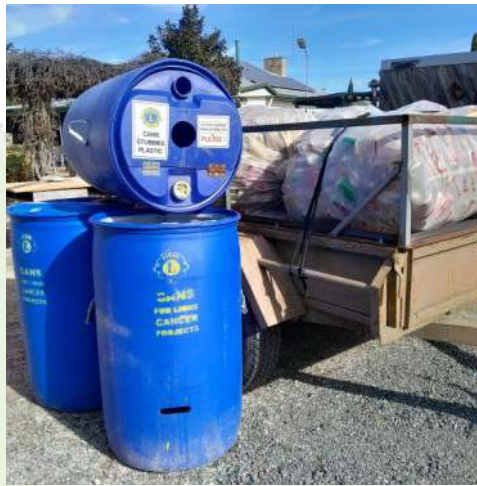
Hope Lions Recycle Project

Australian Lions Childhood Cancer Research Foundation - $6,730.00