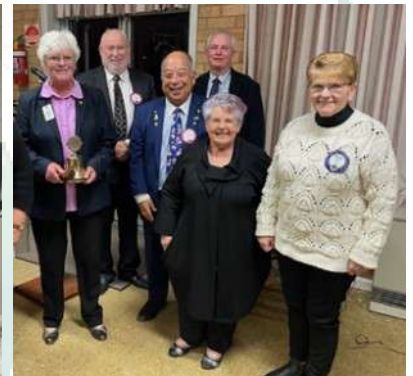
Kerang Lions Club 2023-2024