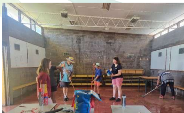
Helping kids in need (right)