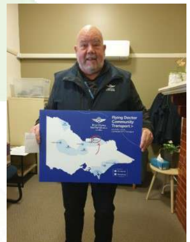
Royal Flying Doctor