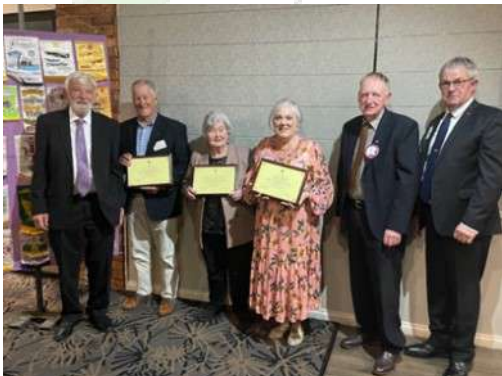
Numurkah Lions Club Chris August Awards

Immediate Past District Governor MD201-V6