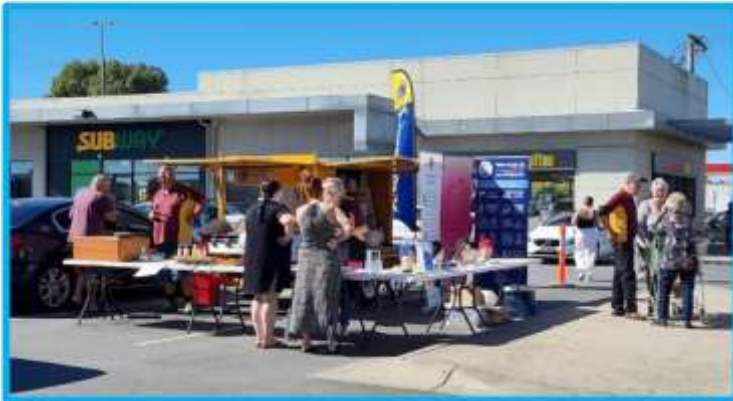
Members of the public could not get passed us; all exits covered.