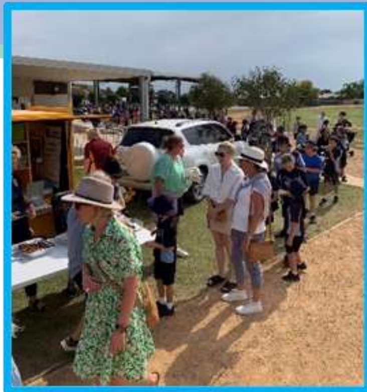
Can't see the end of the queue

We started off our Easter activities by being a part of the celebration of the end of term at Sacred Heart Primary School. In 2 hours we cooked 600 sausages and served at least 400 students, parents and teachers. After lunch everyone participated in a fund raising walk for one of the schools major charities, Caritas. Everywhere we looked there were children with sausages in their hands, on one of our buddy benches, playground equipment or nearby rocks. The queue of hungry humans was long but with the help of the very organised teachers it was a breeze, and so much fun. At the end of day we received 3 Hip Hip Hoorays from the whole school – a very special day.