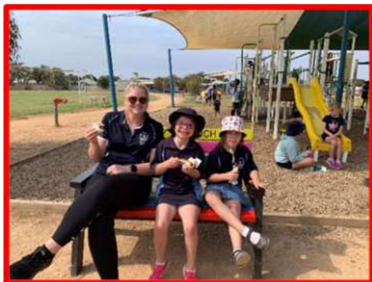
Outdoor dining on one of our buddy benches