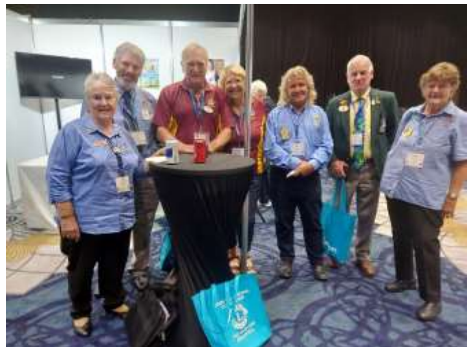
Some of the V6 cohort at the MD Convention