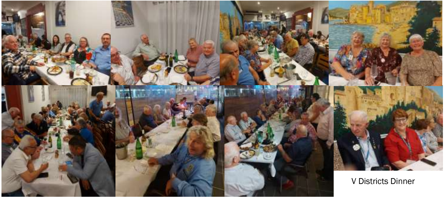
V Districts Dinner