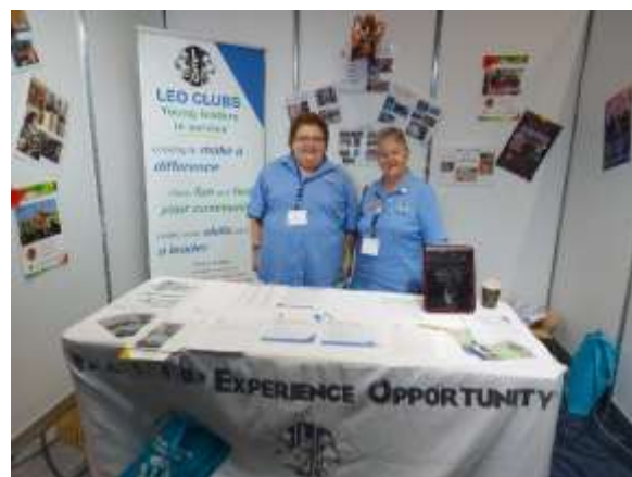
V6 faces on the stalls around the convention - LEOs (above) Junior Public Speaking (right) And ALCCRF Well done to members for manning these sites and promoting the work we do.