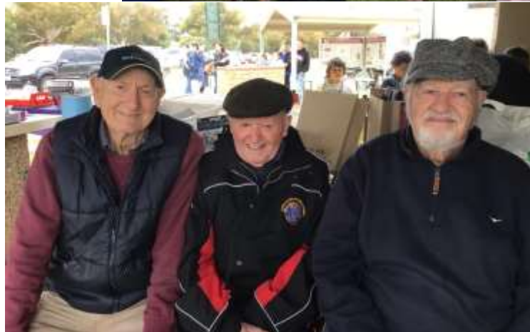
Driver Reviver tea and coffee on Good Friday and Good Friday eve!