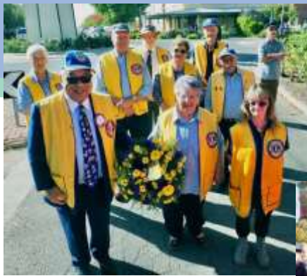
Anzac Day March and Wreath Laying Ceremony at Cenotaph.