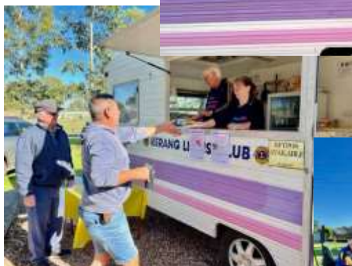
Lions Biggest BBQ at Kerang Community Market on 22/4/23. All proceeds to ALCCRF! Super successful day!