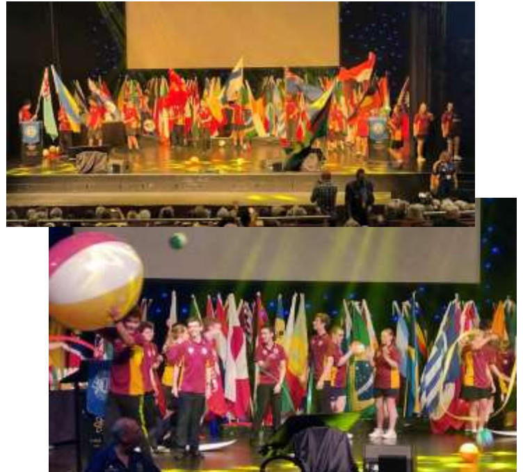
LEOs helping with the flag ceremony