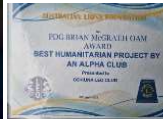
"Hug in a Rug" project