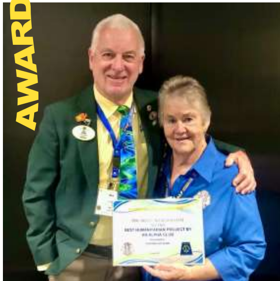
Congratulations to the Cohuna Leo Club for the best humanitarian project by an Alpha Leo Club in Australia