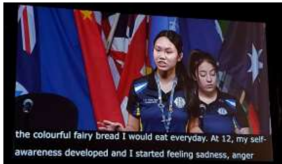
V district LEO of the Year entrant