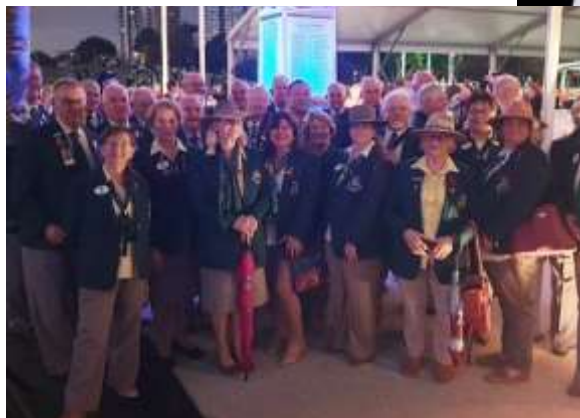
DG's & DGE's & partners at the MD Convention on the Gold Coast