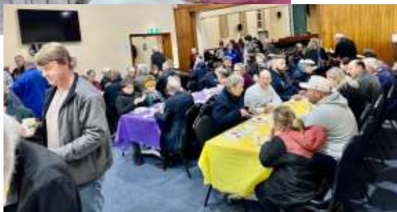
Anzac Day Gunfire Breakfast- over 120 people fed by Kg Lions and partners.